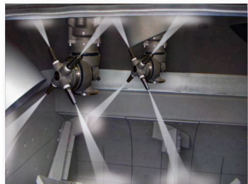
A80R heads installed in a twin-shaft mixer